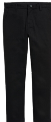
BOYS OLD NAVY SLIM CHINO PANTS