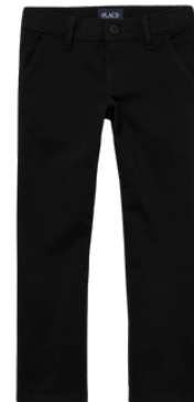
GIRLS UNIFORM PULL ON JEGGINGS