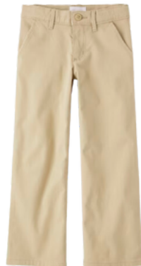
GIRLS WIDE LEG CHINO PANTS