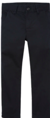
BOYS UNIFORM CHINO PANTS