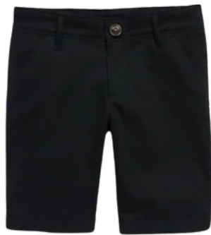
GIRLS TWILL BERMUDA SHORTS

Girls skirts and polos must be purchased through our French Toast online school store. Girls may also wear black or khaki pants or shorts from the uniform line at Old Navy or Children's Place. We will do an in-house order of embroidered uniform dresses in August, the typical cost per dress is about $25. During the colder months black, grey, or white leggings or tights may be worn under dresses and skirts. Our preferred girls pants and shorts are linked below: