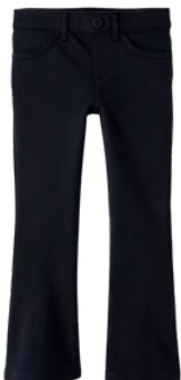
GIRLS UNIFORM PULL ON FLARE PANTS