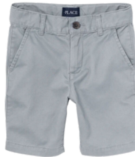
BOYS UNIFORM CHINO SHORTS