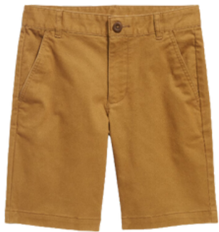
BOYS STRAIGHT SHORTS

Boys may wear black, khaki, or grey uniform slacks or shorts. Our preferred retailers are Old Navy, Children's Place, and H&M. Both Old Navy and Children's Place have their own uniform line, and H&M has good quality modern slacks and shorts as well. Our preferred boys pants and shorts are linked below: pants and shorts are linked below: