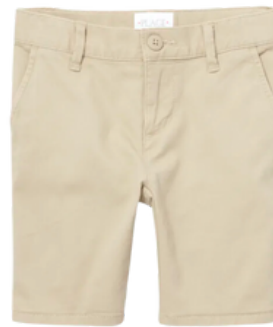
GIRLS UNIFORM CHINO SHORTS